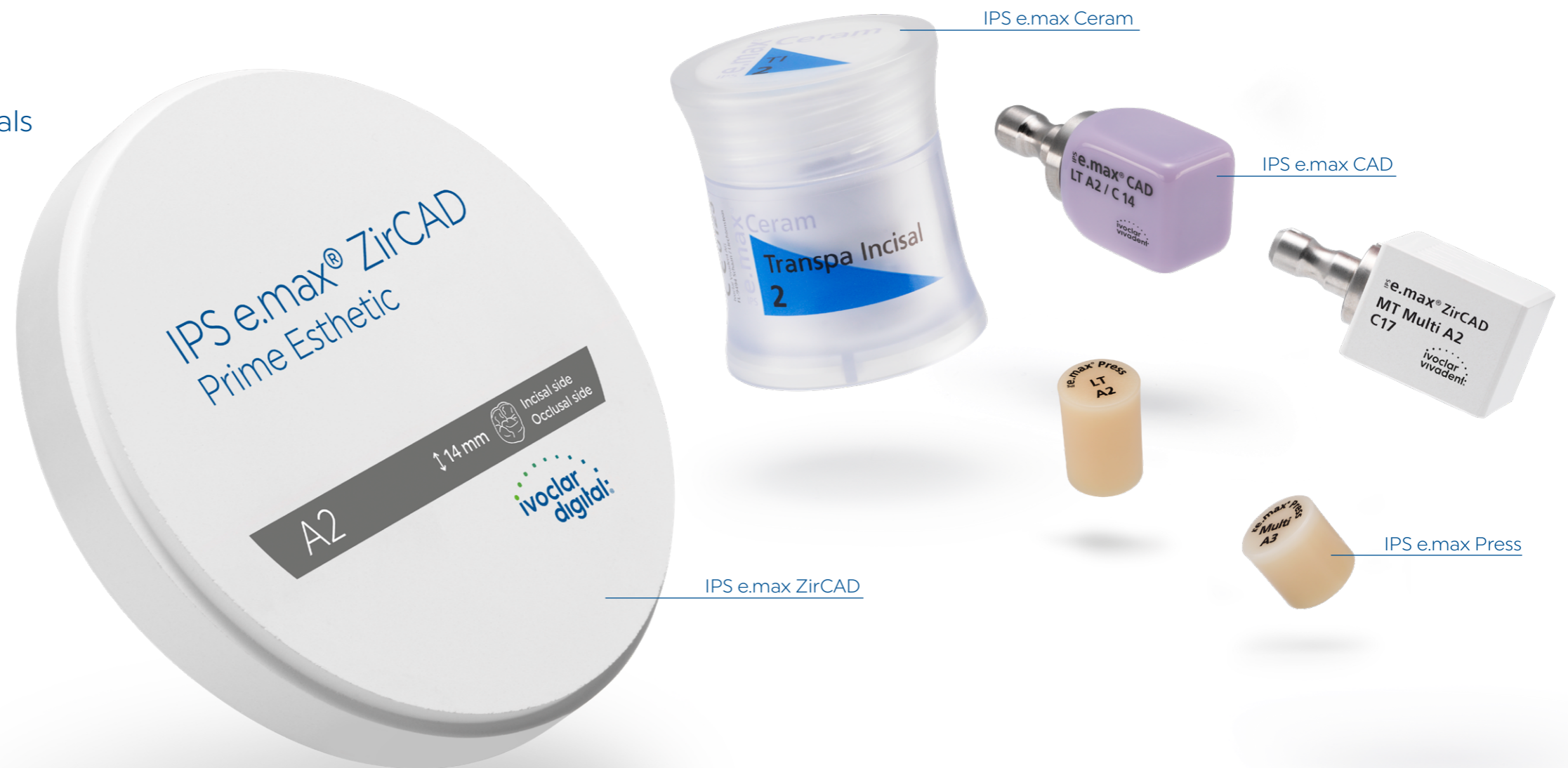
IPS e.max Ceram

IPS e.max stands for expressive esthetics, high reliability and maximum flexibility. The IPS e.max range comprises all-ceramic materials for the press and CAD/CAM technology and allows you to realize all types of fixed prosthetic restorations.