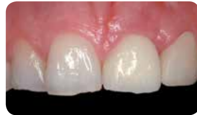
Temporary made from Telio